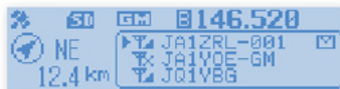
Group Monitor Screen