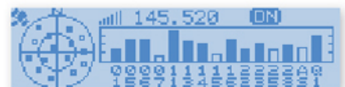
GPS Information Screen