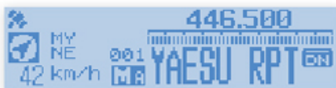
Memory Tag Screen

The white-LED backlight provides ample brightness and contrast, for improved visibility. The display screens guide you in using the advanced features and changing operating settings.