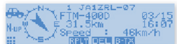
APRS Information Screen